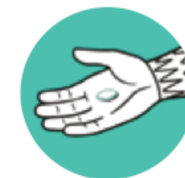
Pill not actual size.

EPCLUSA can be convenient to take since it's only one pill, once a day. It also comes in a regular pill bottle small enough to fit in your pocket. That means you can be discreet.